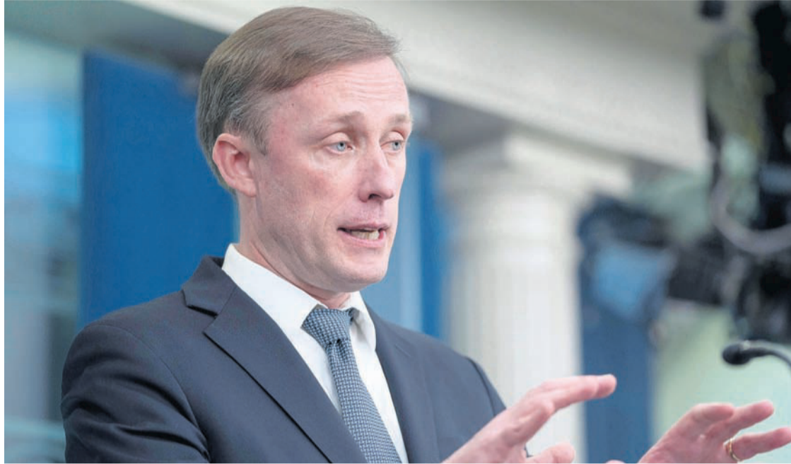
National Security Advisor Jake Sullivan speaks during a press briefing at the White House in Washington, Wednesday, Feb. 14, 2024.

"The global coalition imposing unprecedented sanctions on Russia's war machine has thrown sand in the gears of the Kremlin's efforts to equip and supply its military. President Biden recently expanded Treasury's authorities to target those funding Russia's war production efforts even if they're located in third countries and Treasury is aggressively pursuing those